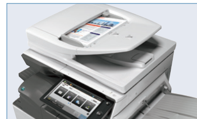
Sharp's ImagesSEND™ feature provides one-touch distribution to email, cloud applications and more.