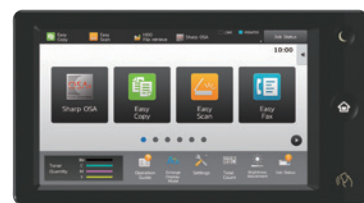
Award-winning 10.1" (diagonally measured) customizable touchscreen display.