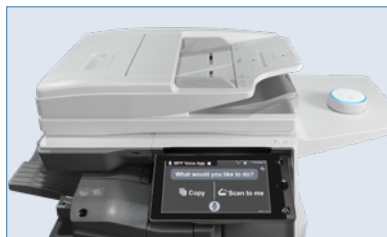
MX-4071 shown with available Sharp MFP Voice feature with Alexa.