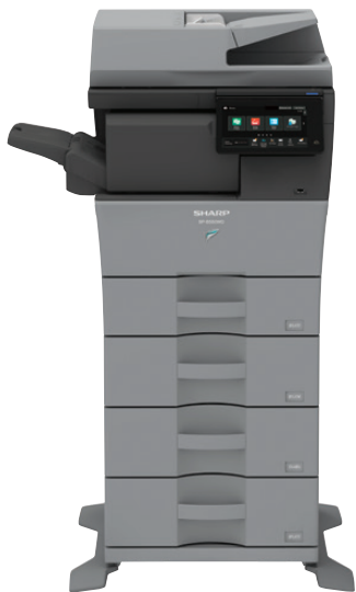
BP-B550WD shown with Inner Finishing Unit in a 4-drawer configuration.